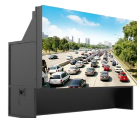
Laser Light Source